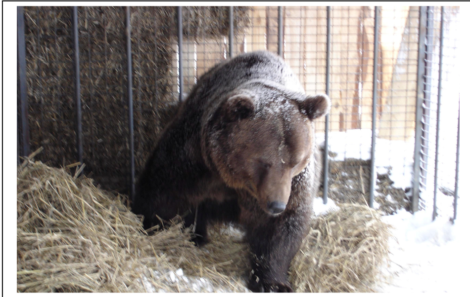
Lydia the bear in a temporary cage after arrival at the Sanctuary

There are 25 rescued bears living in quarantine cages or in the forest enclosures of the sanctuary which have been rescued from poor captive conditions around the country.